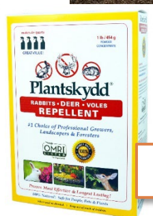
Plantskydd animal repellent sales