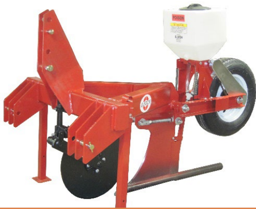
Gopher Getter available for rent

The District also offers gopher machine rental, gopher bait sales, Plantskydd sales and custom tilling.